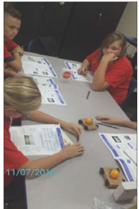
Fifth graders travelled to Starbase, in Salina Kansas on Nov. 7.