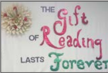
MS library welcomes students and visitors with themed posters.