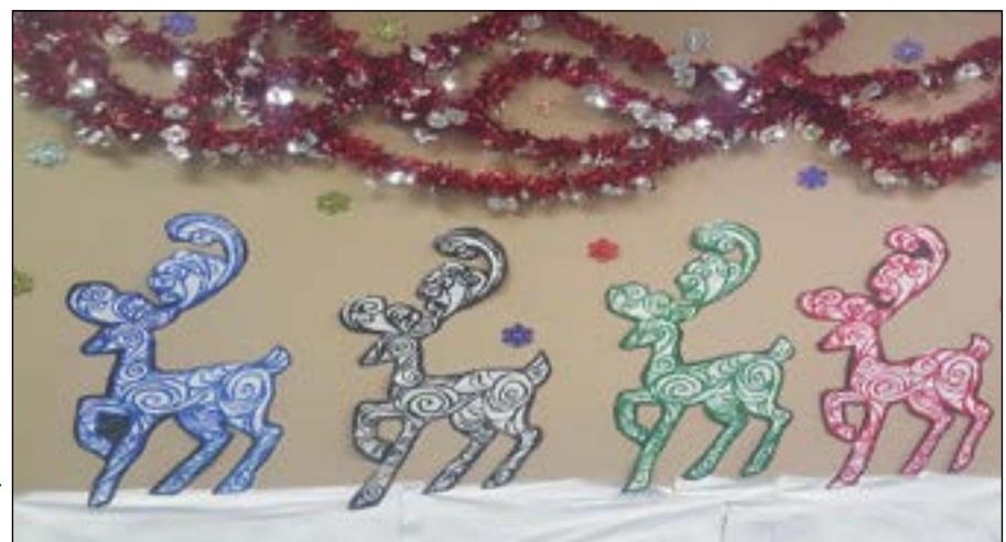
MS library features Christmas themed posters to spread holiday spirit.